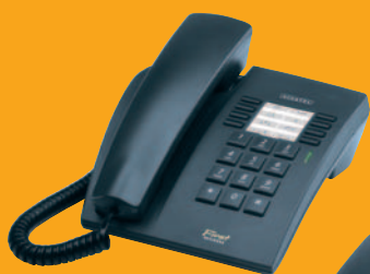
▲ Reflexes™ First